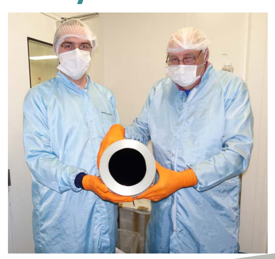
Coated base and wall to complete flight like cavity